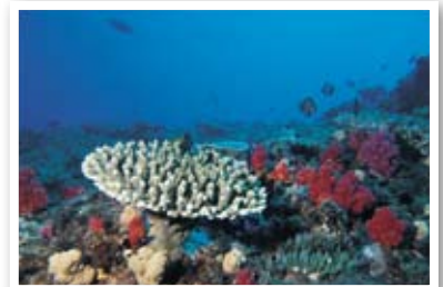
Flinders Reef has the highest diversity of corals in Moreton Bay Marine Park.

AMCS has begun a scientific project with the University of Queensland, to learn more about the Park's poorly understood Manta Rays, which are threatened by fishing throughout the world's oceans.