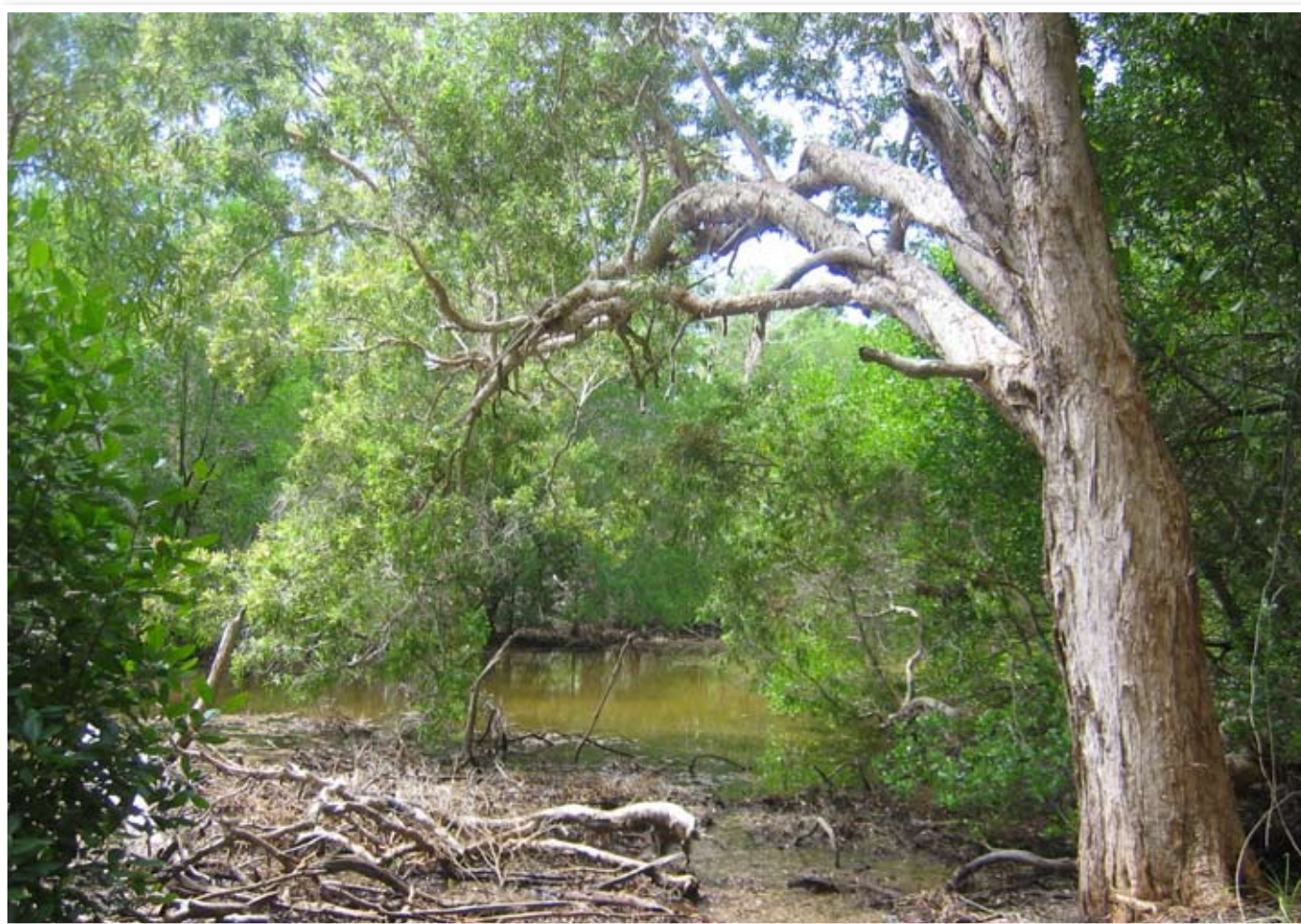
This area at Glyde Point was destined to be the site for a large scale industrial development until AMCS and the community convinced the Northern Territory Government to reject the proposal.

In 2007 our work with the Environment Centre of the Northern Territory paid off with the protection of Glyde Point, a beautiful coastal jewel 40kms north-east of Darwin. Glyde Point has enormous conservation and cultural significance and is a coastal jewel of the north. The region had been earmarked by successive NT Governments for large scale industrial development, but some vigorous campaigning from AMCS, the Environment Centre NT and our supporters paid off. Glyde Point is now rezoned from industrial land to public open space.