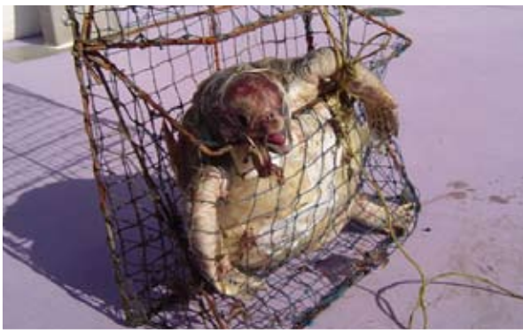
Around 200 sea turtles are reported dead, injured or sick in Moreton Bay Marine Park each year. This dead green turtle was trapped and drowned in this crab pot before it was retrieved by Sea World staff in Moreton Bay Marine Park.

Throughout the year we have called on seafood purchasers and suppliers to take shark off the menu. In 2008 AMCS will be launching a new campaign to protect sharks in the Great Barrier Reef World Heritage Area, where they are under threat from a rapidly developing shark fishery. To Australia's shame, this fishery currently services the international trade in shark fin.