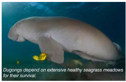
Dugongs depend on extensive healthy seagrass meadows for their survival.