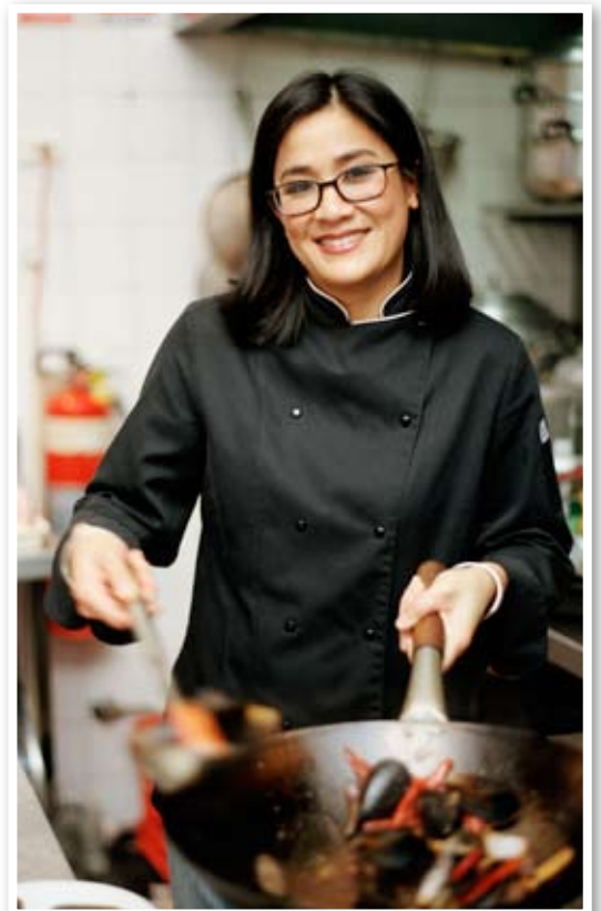
Kylie Kwong cooking up a sustainable seafood delicacy.