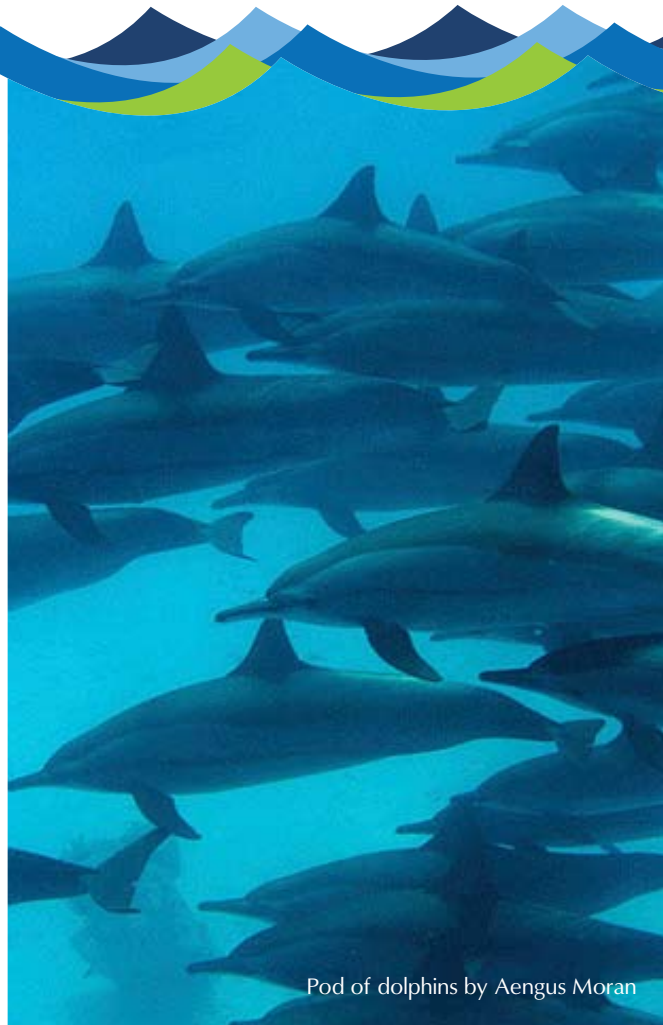
Pod of dolphins