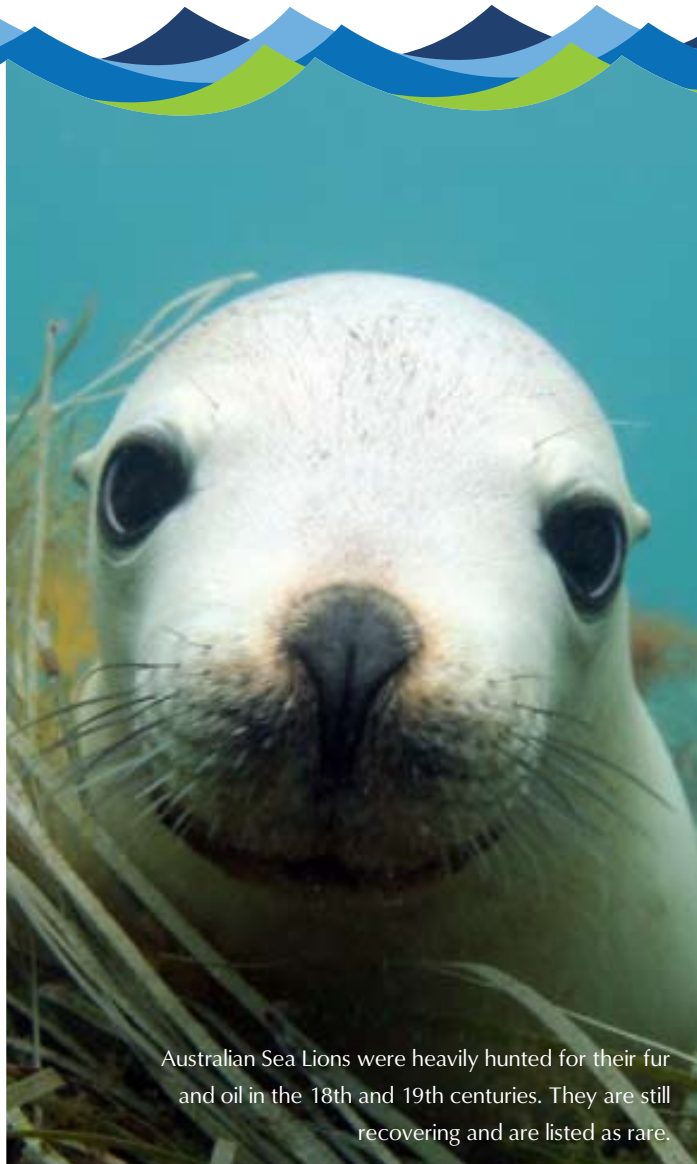
Australian Sea Lions were heavily hunted for their fur and oil in the 18th and 19th centuries. They are still recovering and are listed as rare.

After a decade of funding from the Australian Government, MCCN was unable to secure ongoing funding for the project. MCCN contributed extensively to marine conservation in Australia over the last decade and this lack of funding represents a great loss to community conservation.