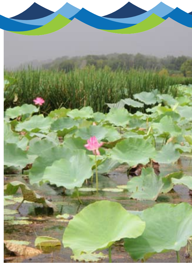
NT wetlands by Ingrid Neilson.

Tasmania needs a network of 'no-take' Marine National Parks to fully protect its marine wildlife into the future. Australian marine scientists agree with this proposal and it is supported by many people in the community. The Tasmanian Government has ignored the general consensus and we must now continue to lobby the government to change their attitude towards marine protection.